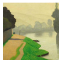
VALLOTTON, FELIX Brume de matin aux Andelys. 1917. Oil on canvas. Sold for CHF 687 000 2014