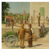
ALBERT ANKER The gym lesson in Ins. 1879. Oil on canvas. Sold for CHF 7.5 million 2013