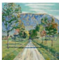
FERDINAND HODLER The road from Evordes. Circa 1890. Oil on canvas. Sold for CHF 1.1 million 2013