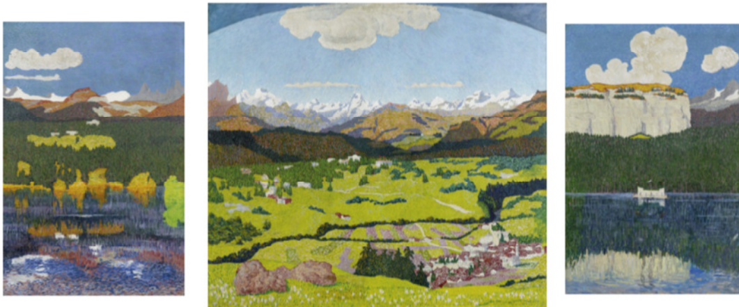
Giovanni Giacometti. Panorama of Flims. 1904. Oil on canvas. 150 x 100 cm, 180 x 200 cm, 150 x 100 cm.

Auction on 24 June 2016 Estimate: CHF 3 - 4 million