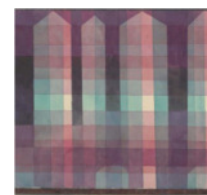
KLEE, PAUL Vier Türme. 1923. Watercolour and pencil on paper. Sold for CHF 1.05 million 2007